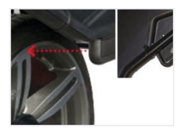
smartSonar™ Automatic rim width detection using sonar sensors to avoid manual entry errors.