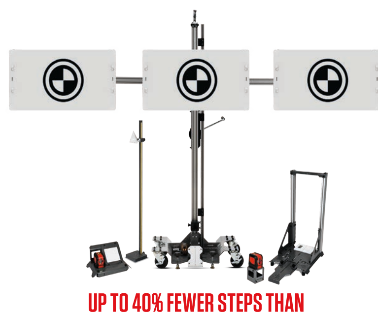
UP TO 40% FEWER STEPS THAN OTHER AFTERMARKET SYSTEMS

Our patent-pending target placement guide-plate provides clear visual indication of vehicle centerline to promote increased accuracy and speed for target positioning.