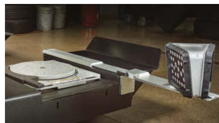
Mounting hardware adapts to common alignment lifts and is easily removed with quick release system.