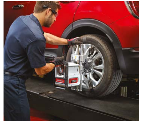
Pods mount with ease, communicating wirelessly and store quickly and easily when finished.

Repairable on-site and boasting remote service and automatic software and specification updates, the V1200 means more revenue for your business, with no more calibrating, no more cables and no more worries.