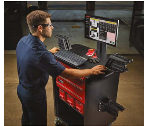
Attractive toolbox styling, featuring easy-rolling casters, storage for all attachments and a fully enclosed printer compartment.