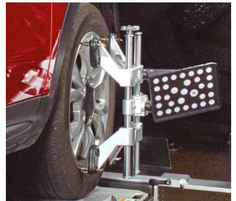
Cast aluminum AC700 wheel clamps fit rims from 11" to 22", with no limitations and 4.9 to 5.2 kg (10.9 to 11.5 lbs.) per clamp.