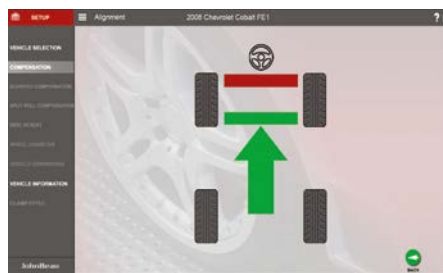
Quick rolling compensation provides critical information via an adaptive user interface, with instant access to productivity tools and assistance.

Rolling run-out compensation means no more hassles: just mount and roll to measure, with no lifting, no head-charging, no head-leveling and no adaptors. Place the V1200 on the lift and it's ready to align.