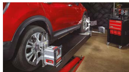
Small footprint makes the most of any available space, bringing advanced, intuitive alignment services to shops of every size.

Using advanced XD cameras and sophisticated monitoring algorithms, the V1200 Wheel Alignment System detects issues with suspension stress and errors from lift clamps, environment, and more. To save time and ensure accuracy on every alignment, users are notified only when necessary—with additional information never more than one click away.