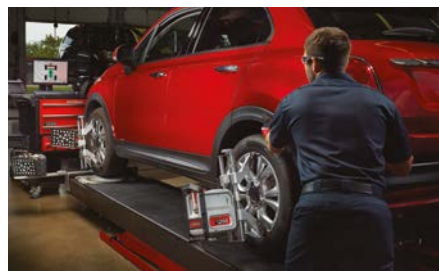
Three levels of intervention – Compensate, Warn, Alert – with corrective actions clearly identified and more information just one click away.